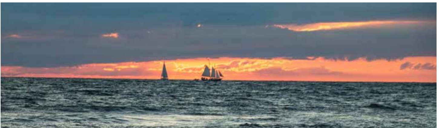
Wind Dancer Under Sail...a wonderful memory of the GVA sunset cruise in August.