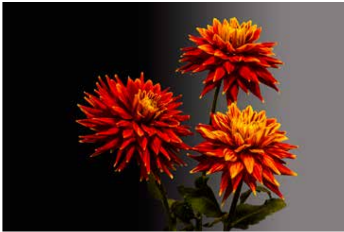
Dahlia Flower by Randy Nyhof

Also last month Lora Cecola and I were at the Fredrick Meijer Gardens to judge photographs of dahlia flowers submitted as part of the Dahlia Flower Show there. After judging the photographs, we wandered through the rooms where others were judging the hundreds of actual flowers for the show. These flower images are a couple of many we took of the flowers displayed.