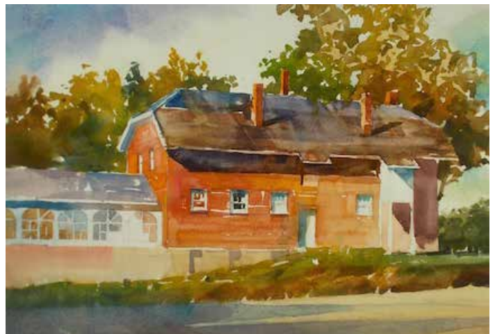
Garage at Felt Mansion by Jim Johnson

http://www.eventbrite.com/e/jim-johnson-loosen-up-and-have-fun-with-watercolor-tickets-19020054495